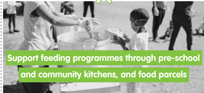
Support feeding programmes through pre-school and community kitchens, and food parcels