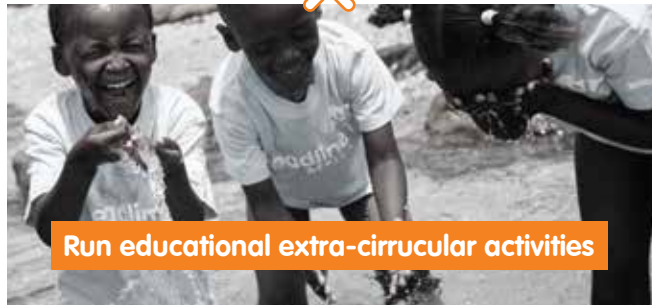
Run educational extra-cirrcular activities